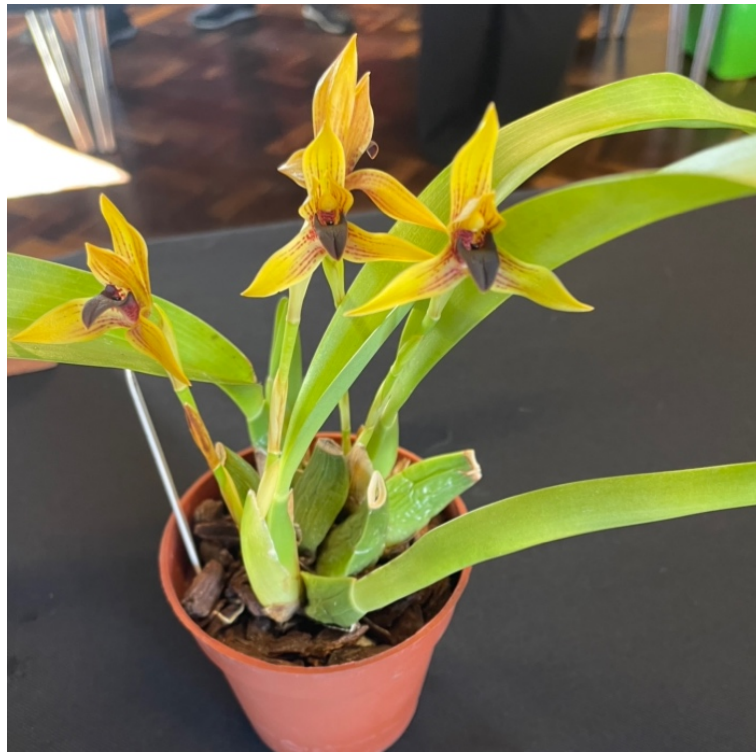
Class 5. Maxillaria meleagris