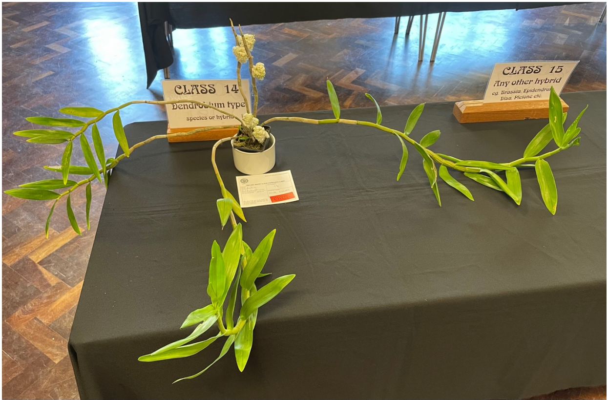
Class 14. Dendrobium goldschmidtianum alba