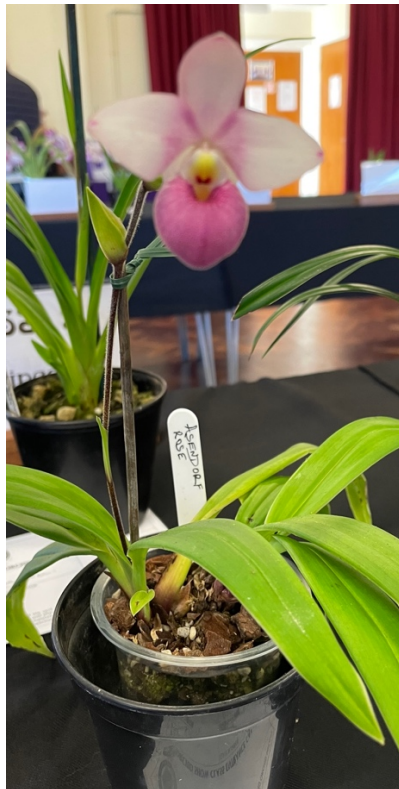
Class 9. Phragmipedium Asendorf Rose