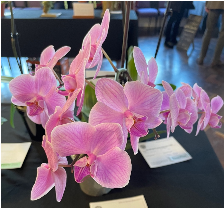
Class 23. Phalaenopsis hybrid