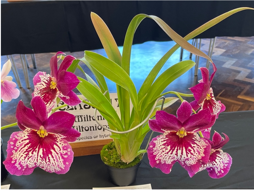
Class 17. Miltoniopsis La Folie