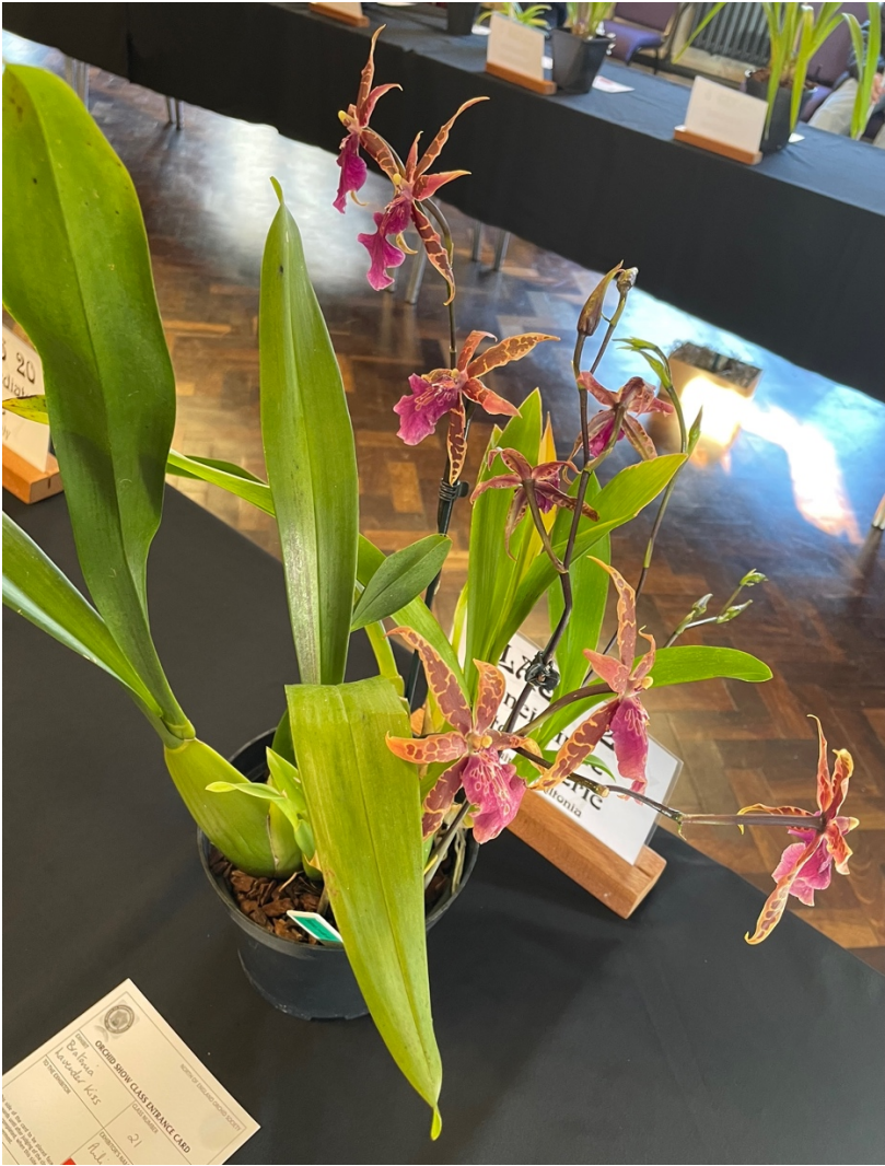
Class 19. Bratonia Lavender Kiss