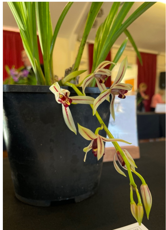
Class 7. Cymbidium dayanum