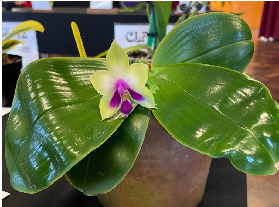
Class 13. Phalaenopsis bellina