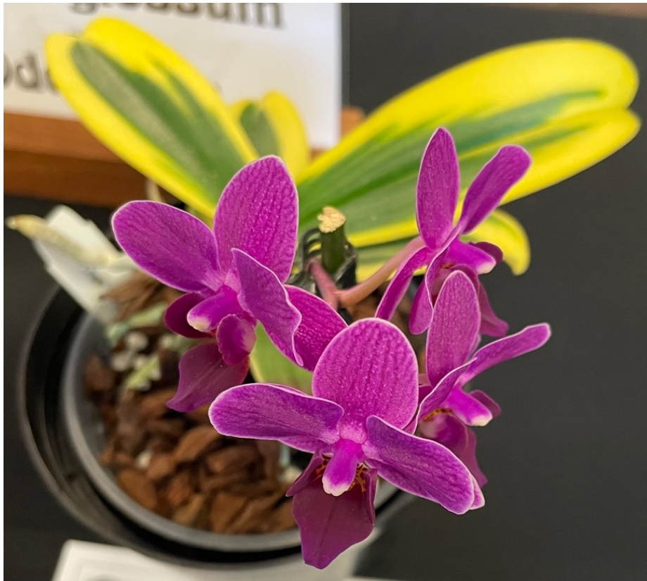
Ian Eastwood's Phalaenopsis Sogo Yenlin