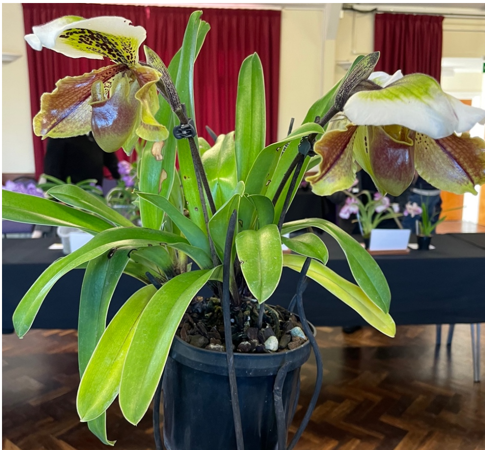
Leon Skorczewski's Paphiopedilum Winston Churchill 'Indomitable'