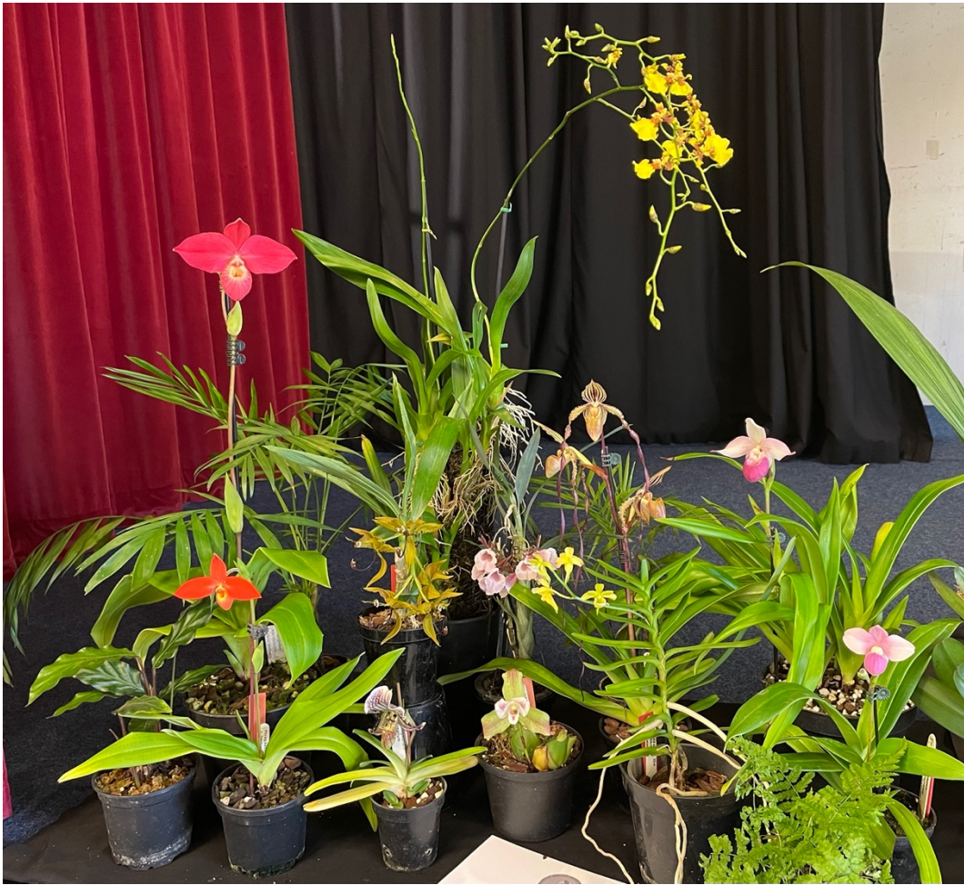
The Phoenix Orchids display gained a Silver Medal