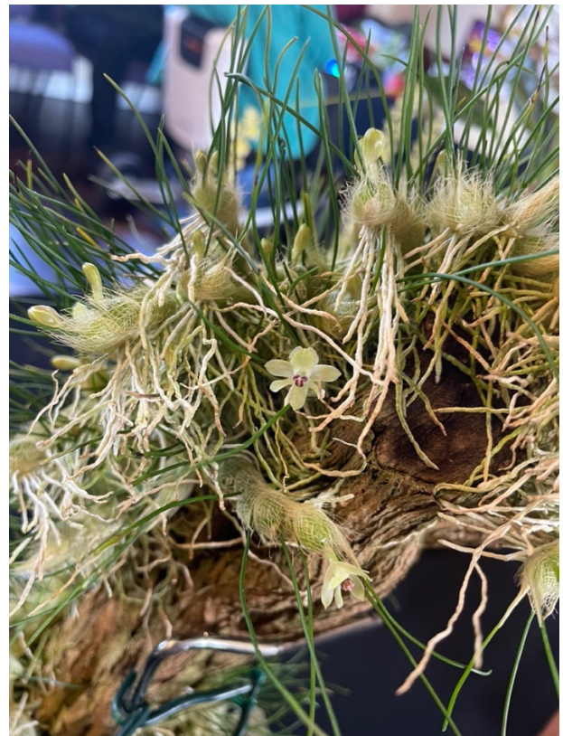
Class 4. Isabella virginalis