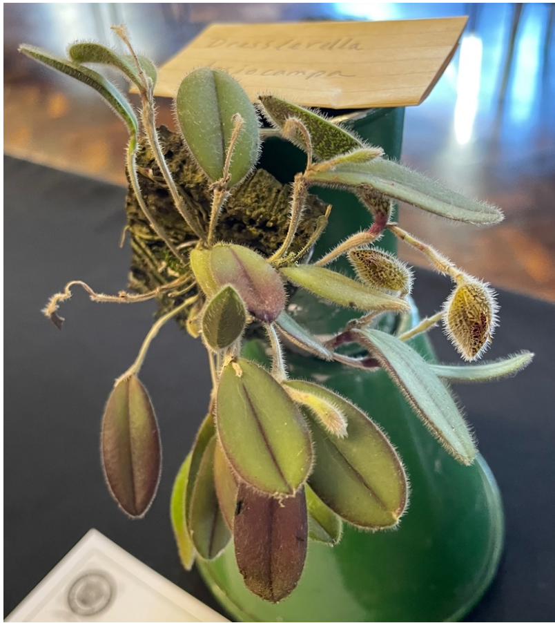
Class 22. Dresslerella lasiocampa