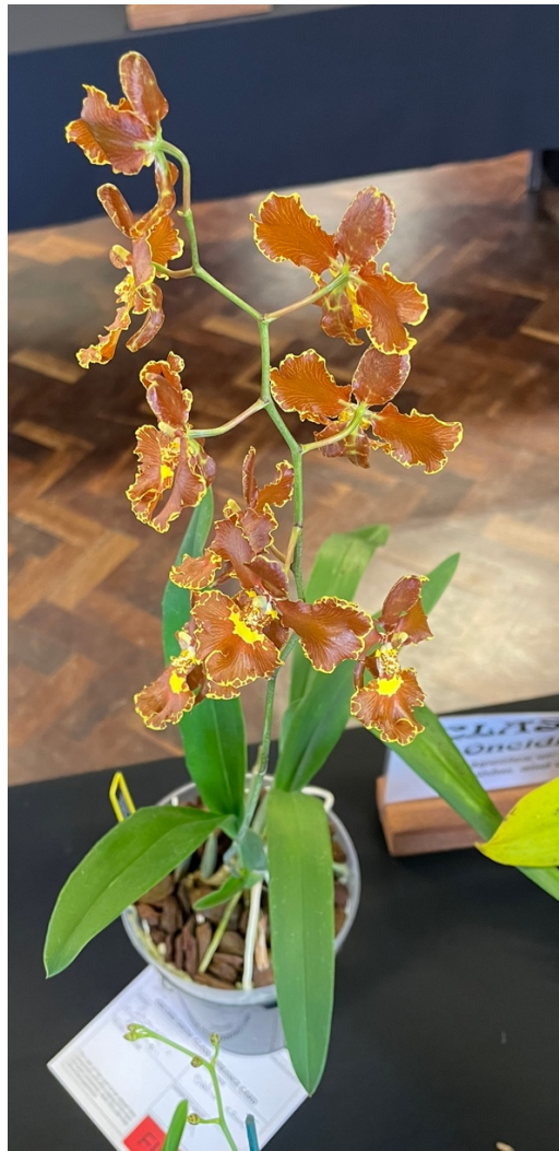
Class 11. Gomesa praetexta x forbesii