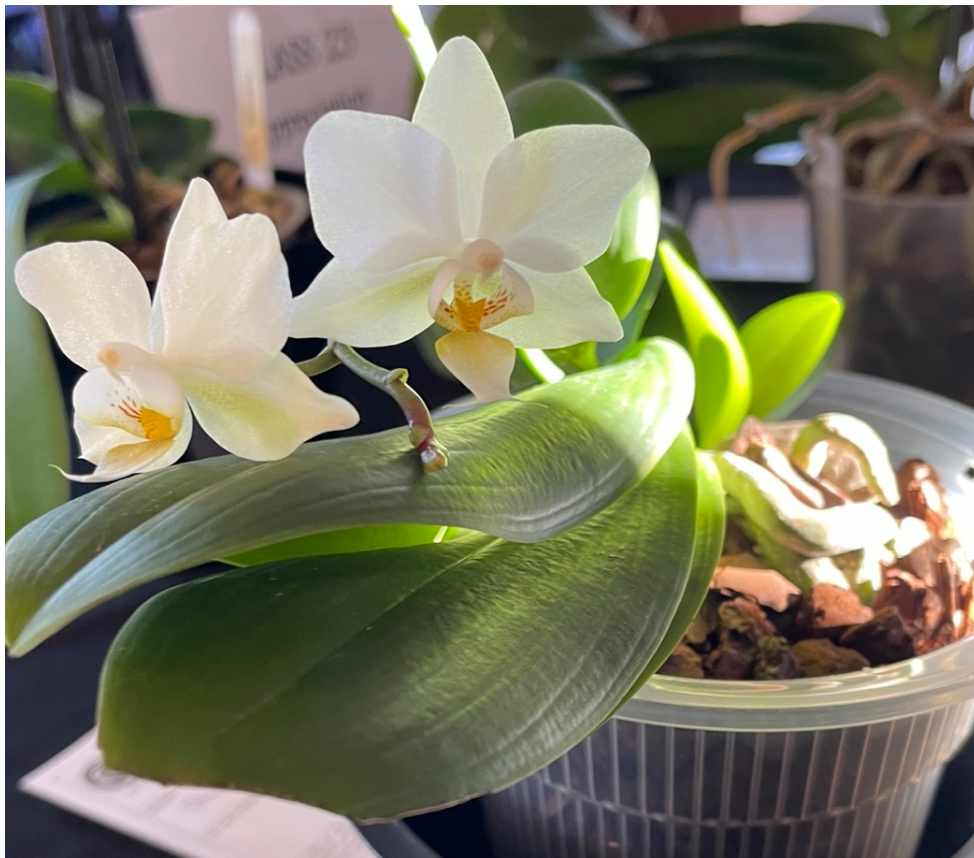
Robyn Gee's Phalaenopsis hybrid