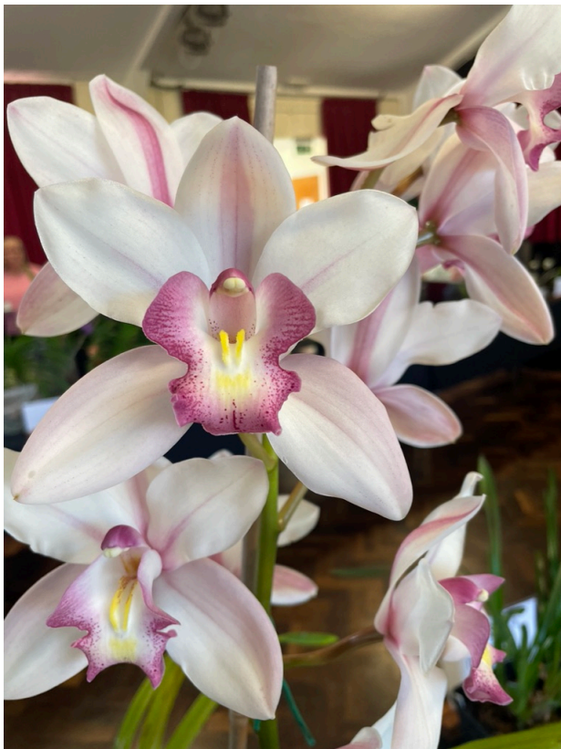
Class 6. Cymbidium Summer Magic 'Pink'