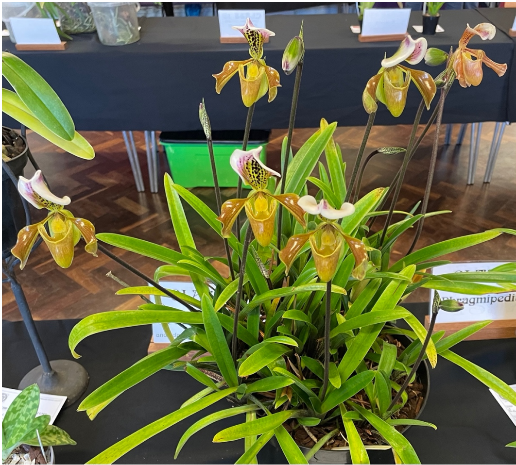
Class 8. Paphiopedilum gratixianum