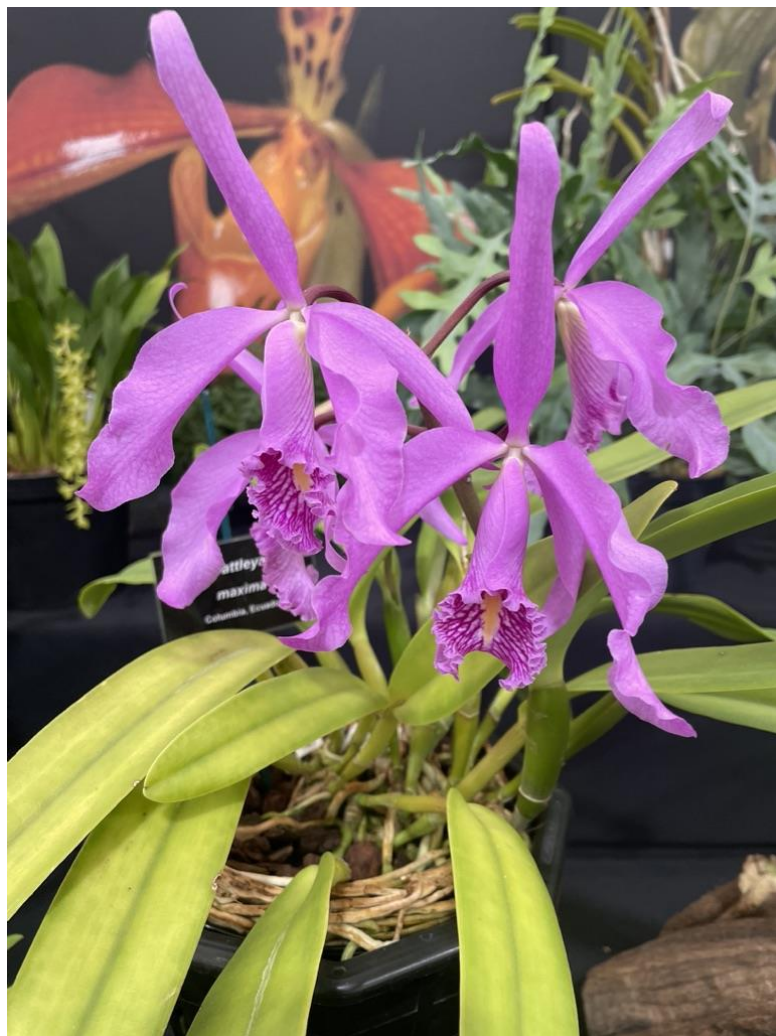
David's Cattleya maxima