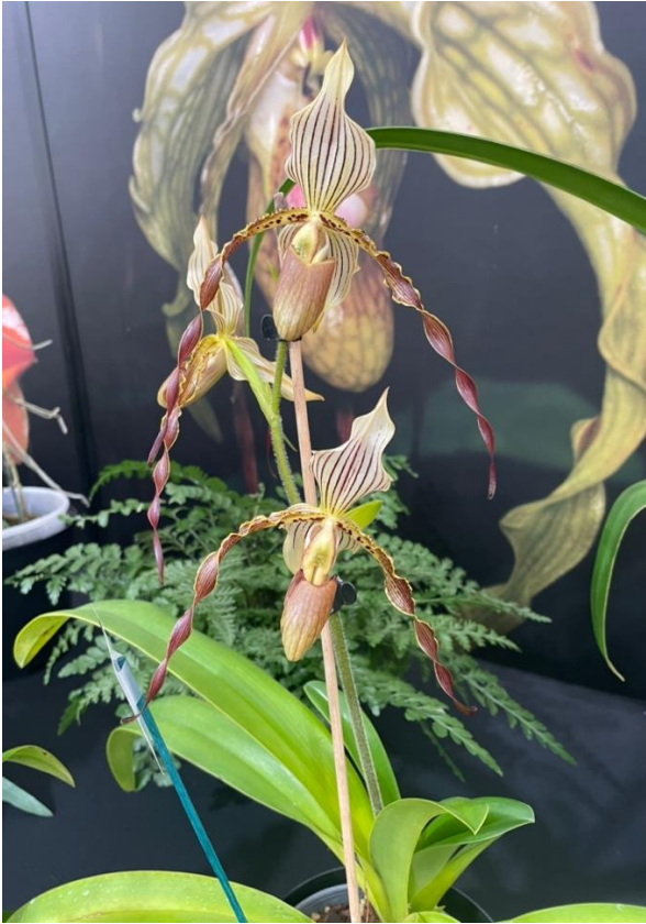
George's Paphiopedilum parishii x praestans