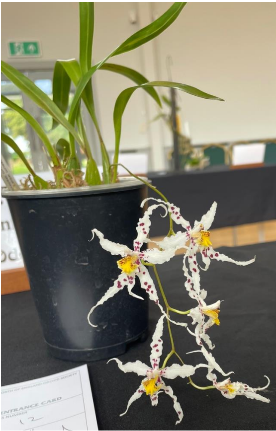
Odontoglossum Gay Starshooter