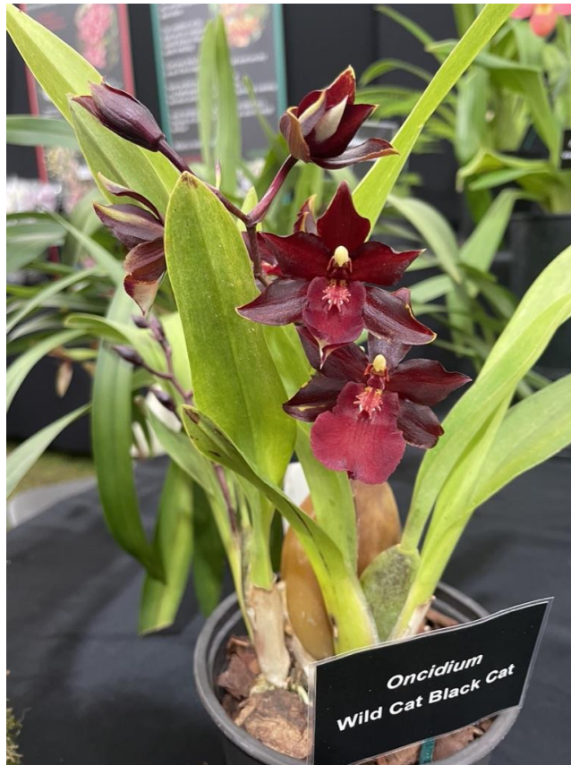
Philippa's Oncidium Wildcat 'Black Cat'