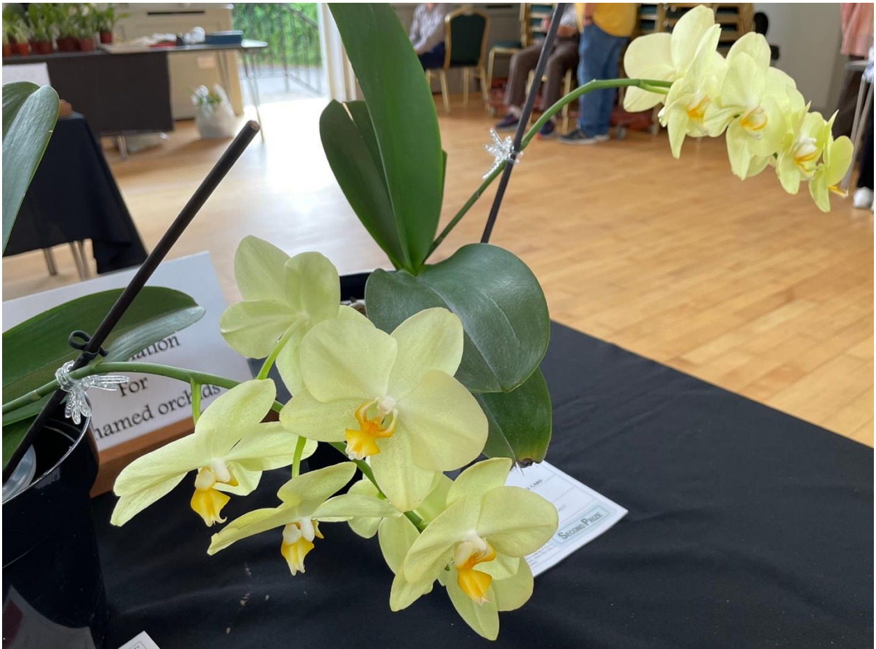
Class 23 Phalenopsis