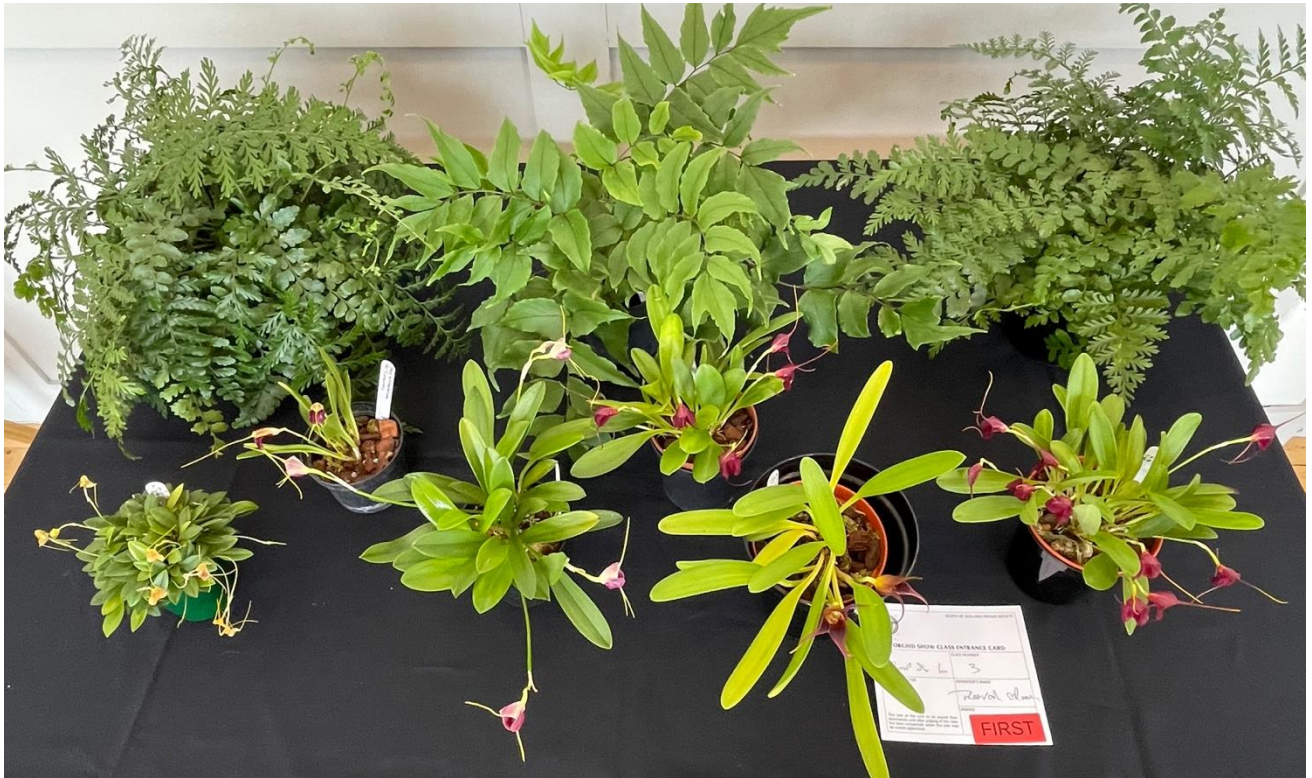
Group of six orchids