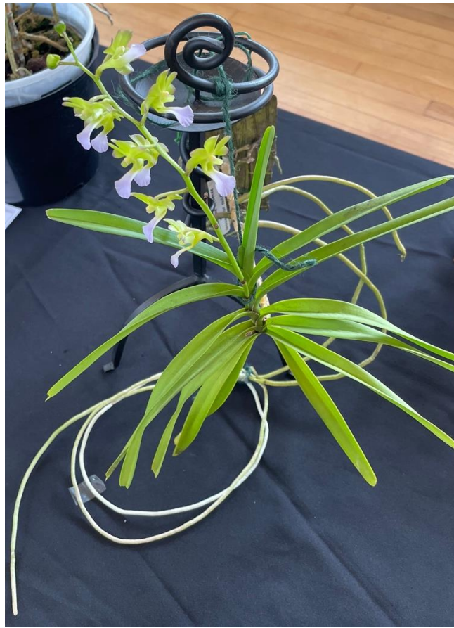
Christensoniana vietnamica x Rhychostele coelestis