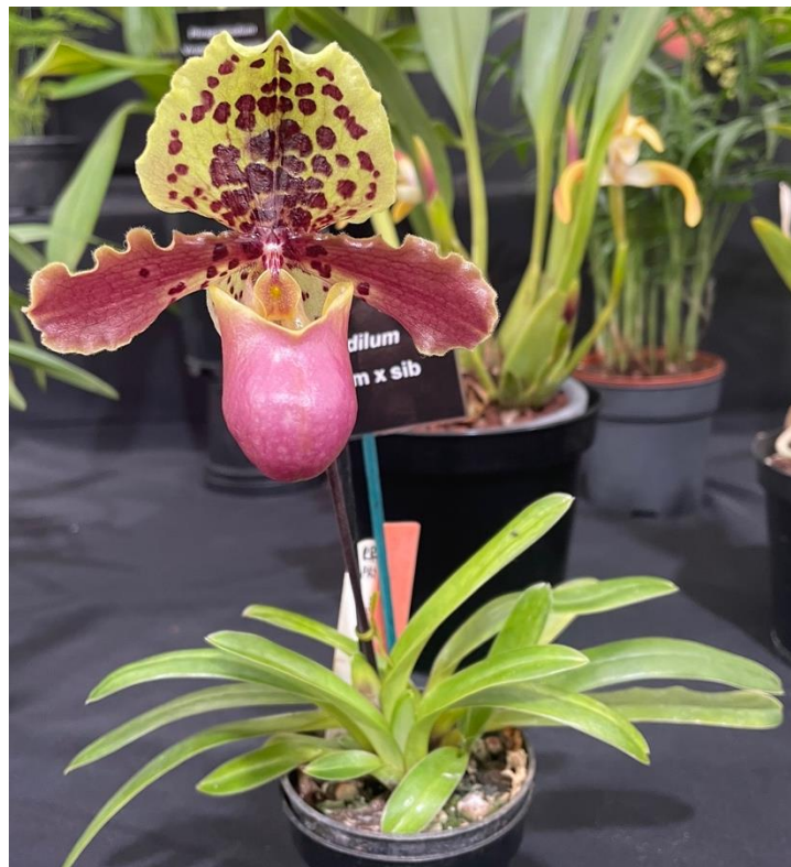
Below, their Paphiopedilum henryanum (sib cross)