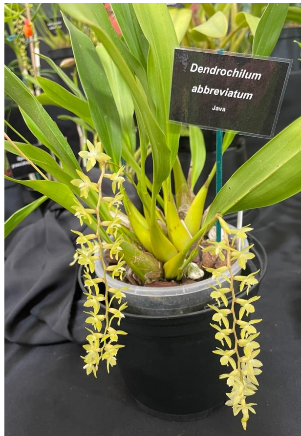
Leon's Dendrochilum abbreviatum