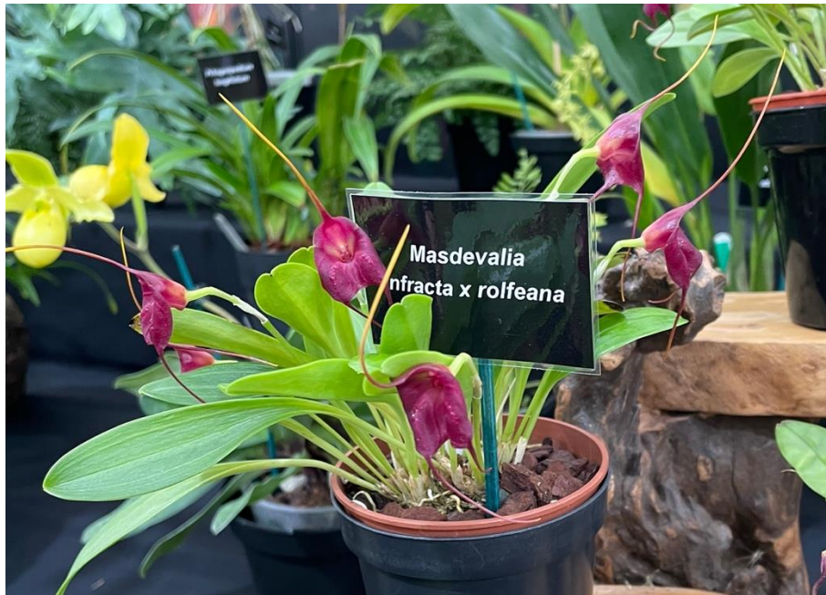
Trevor's Masdevallia infracta x rolfeana