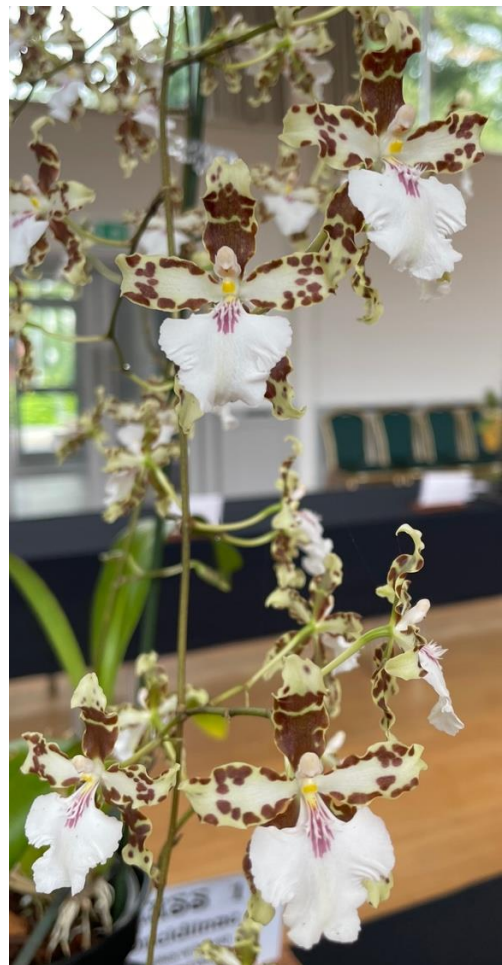
Oncidium trilobum 'J.E.M.'