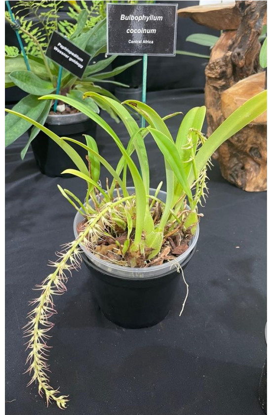
and Bulbophyllum cocoinum

Below, his tiny Schoenorchis fragrans amazed visitors to the show.