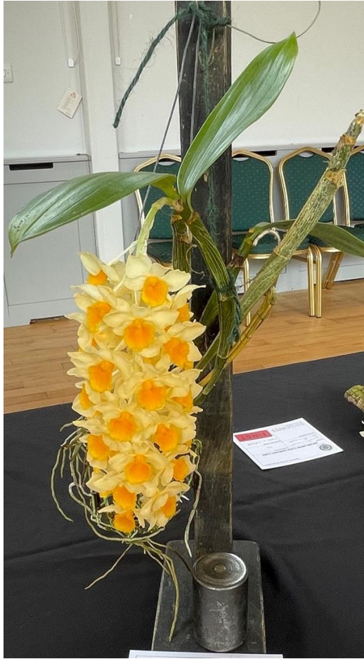
Denys's Dendrobium densiflorum var. griffithii