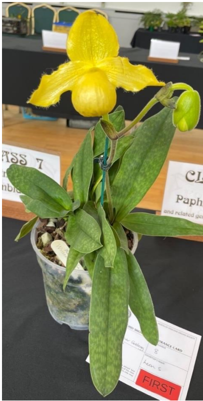
Paphiopedilum Wossner Goldegg.