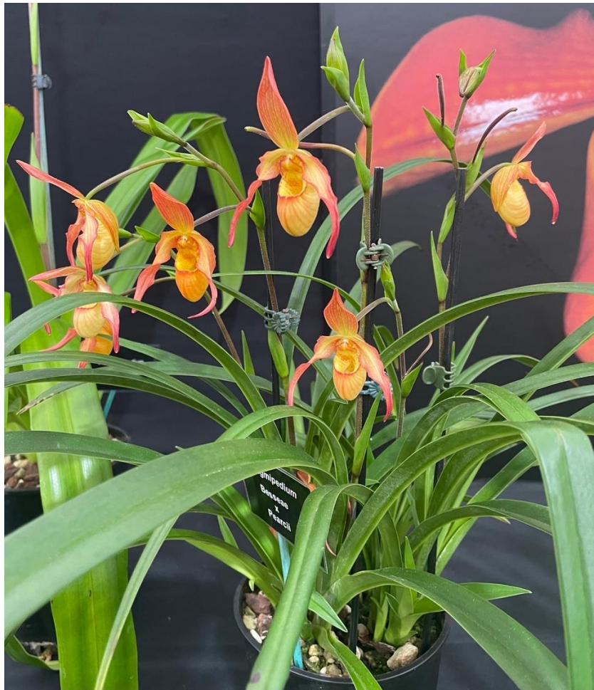
Richard & Dorothy's Phragmipedium besseae x pearcii

Here are just some of the plants in our display: