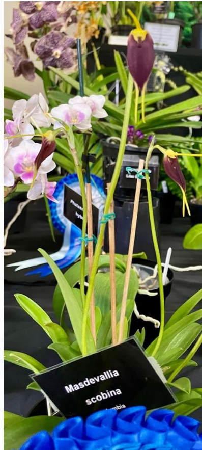
Best Pleurothallidinae species: Trevor Crook's Masdevallia scobina