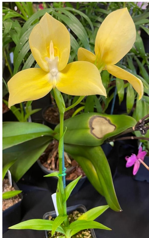
Disa uniflora 'Yellow' (‘Rare as hens’ teeth’, says Mick)