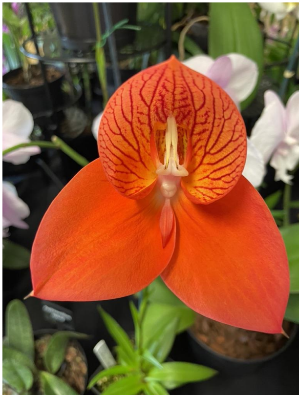
Disa Glasgow Orchid Conference 'Firefly'

A few of Mick Bee's dazzling Disas on the Hinckley & District stand