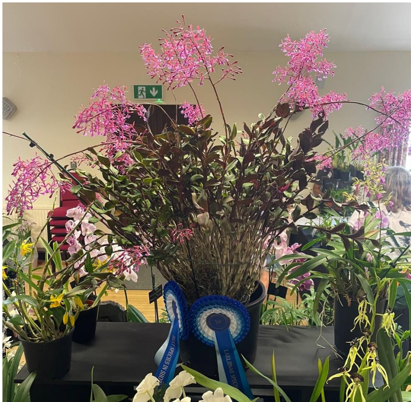
Best Species in Show: Hilary Hobbs's (Harrogate) Epidendrum capricornu