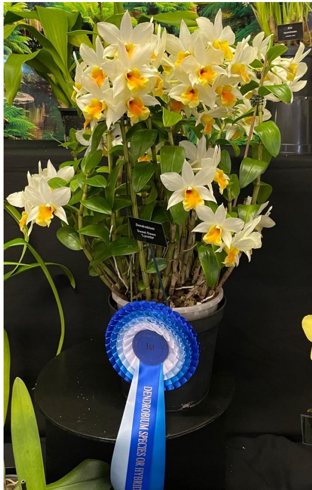
Best in Dendrobium class: Sheila Yates's Dendrobium Sweet Dawn 'Lynette'