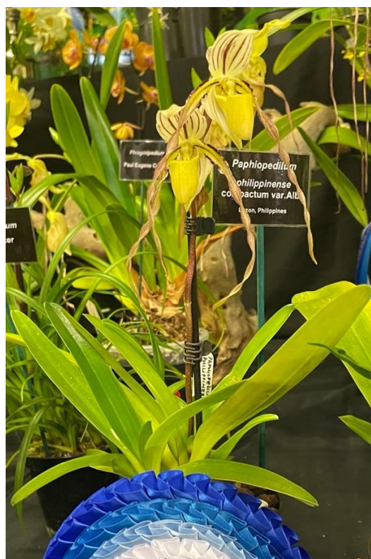
Best Paphiopedilum species: Richard Rhodes's Paphiopedilum philippinense compactum var. album