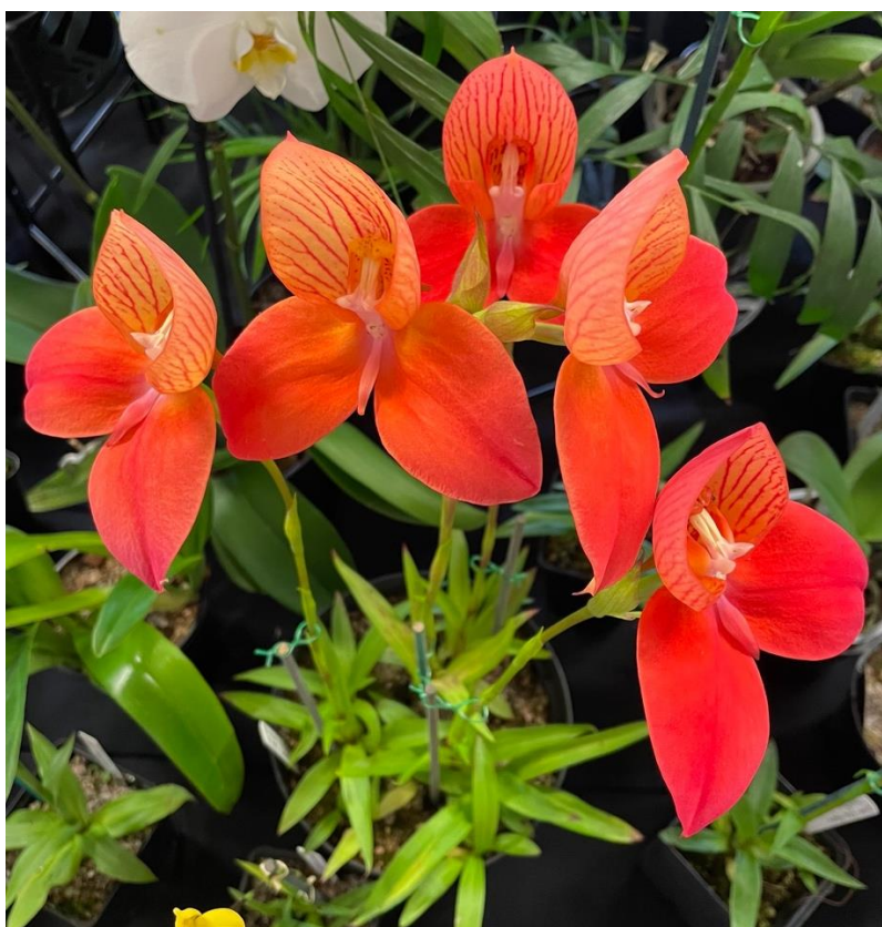
Best Any Other Hybrid - Disa Oak Valley x Ella Avery