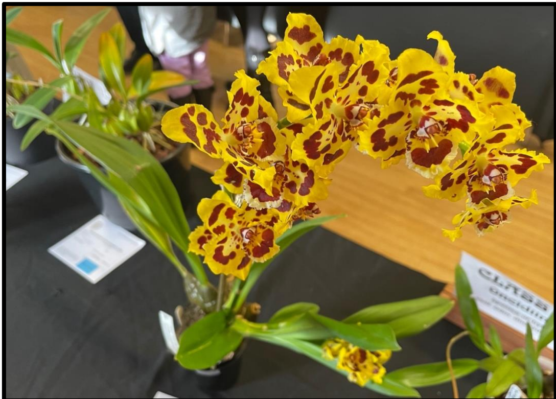
Class 11. Oncidium Col de la Rocque