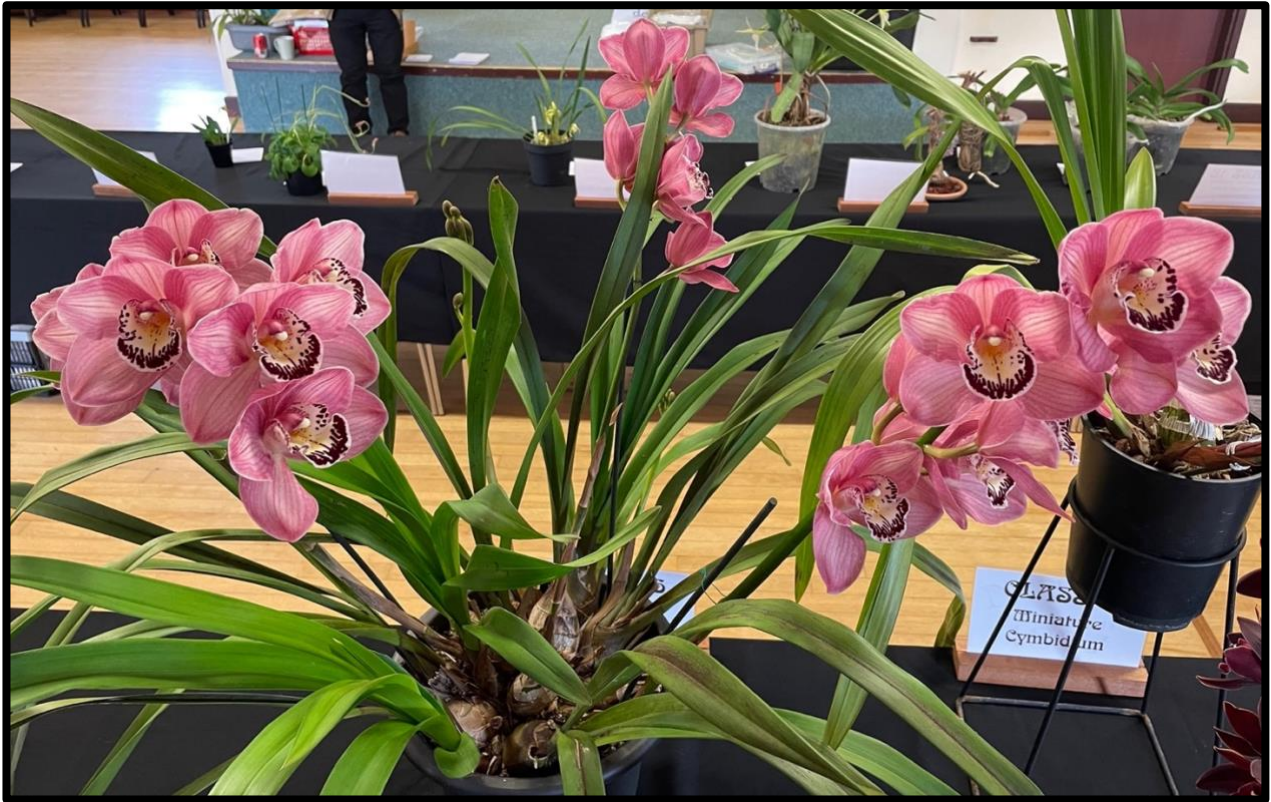
Class 6. Cymbidium Shirley