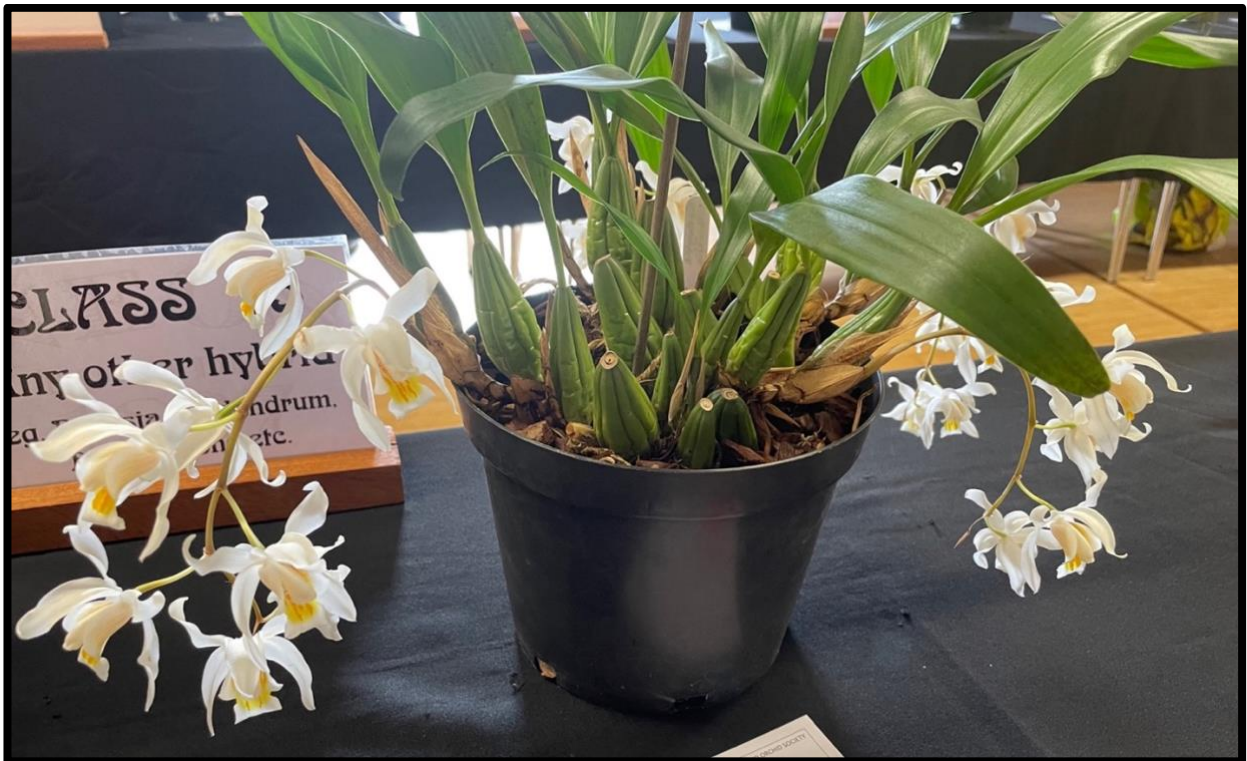
Class 15. Coelogyne intermedia