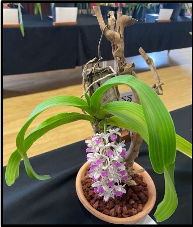
Ian Eastwood's Rhynchostylis gigantea