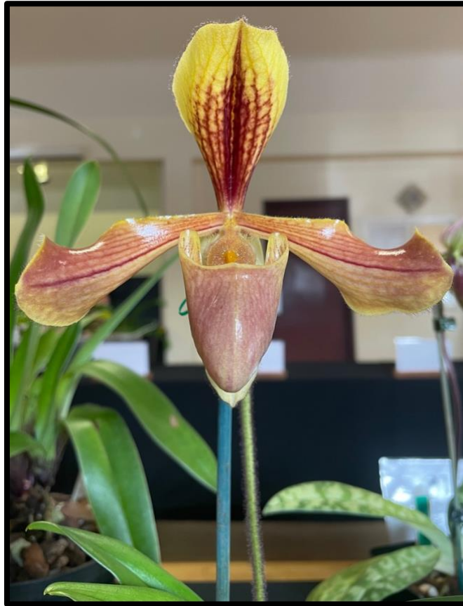
Class 8. Paphiopedilum villosum