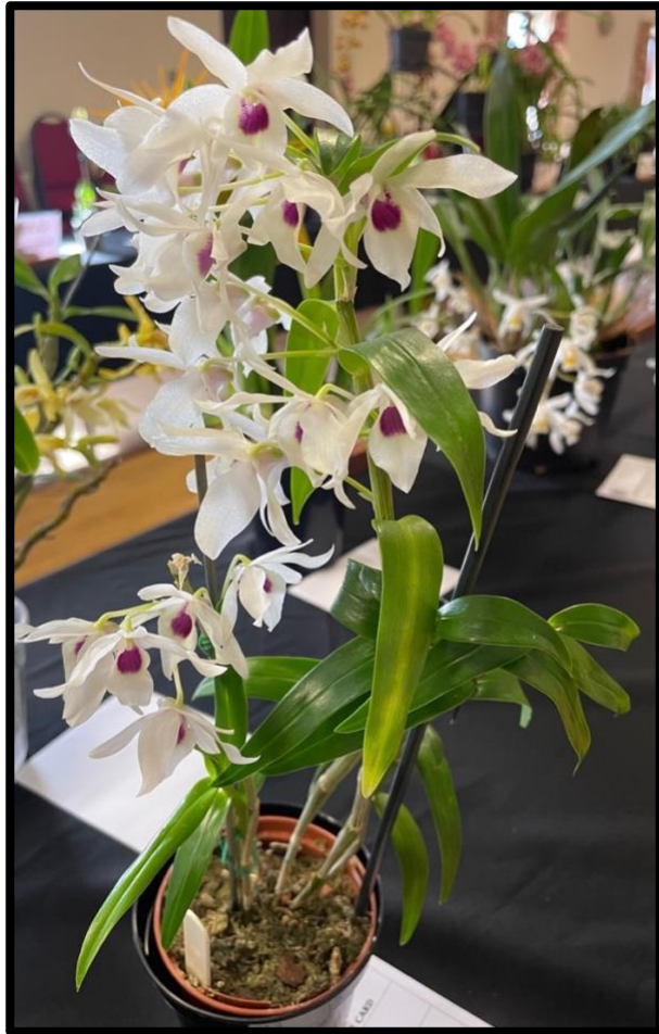
Class 14. Dendrobium Cassiope