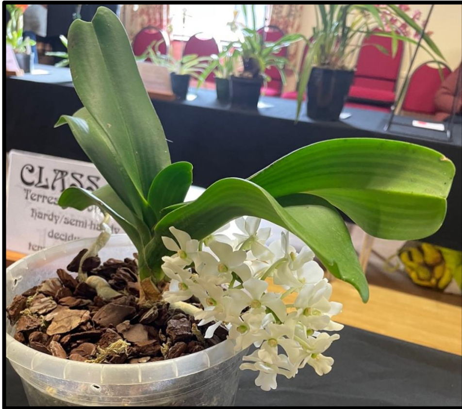
Class 19. Rhynchostylis gigantea White.