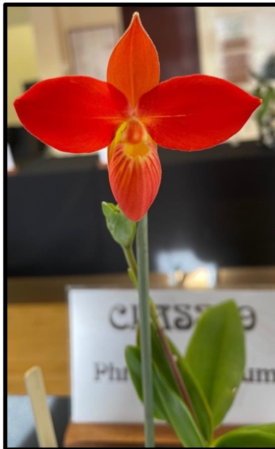
Class 9. Phragmipedium besseae