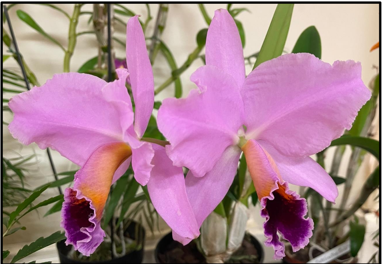
In close-up: Cattleya percivaliana 'Summit' FCC/AOS