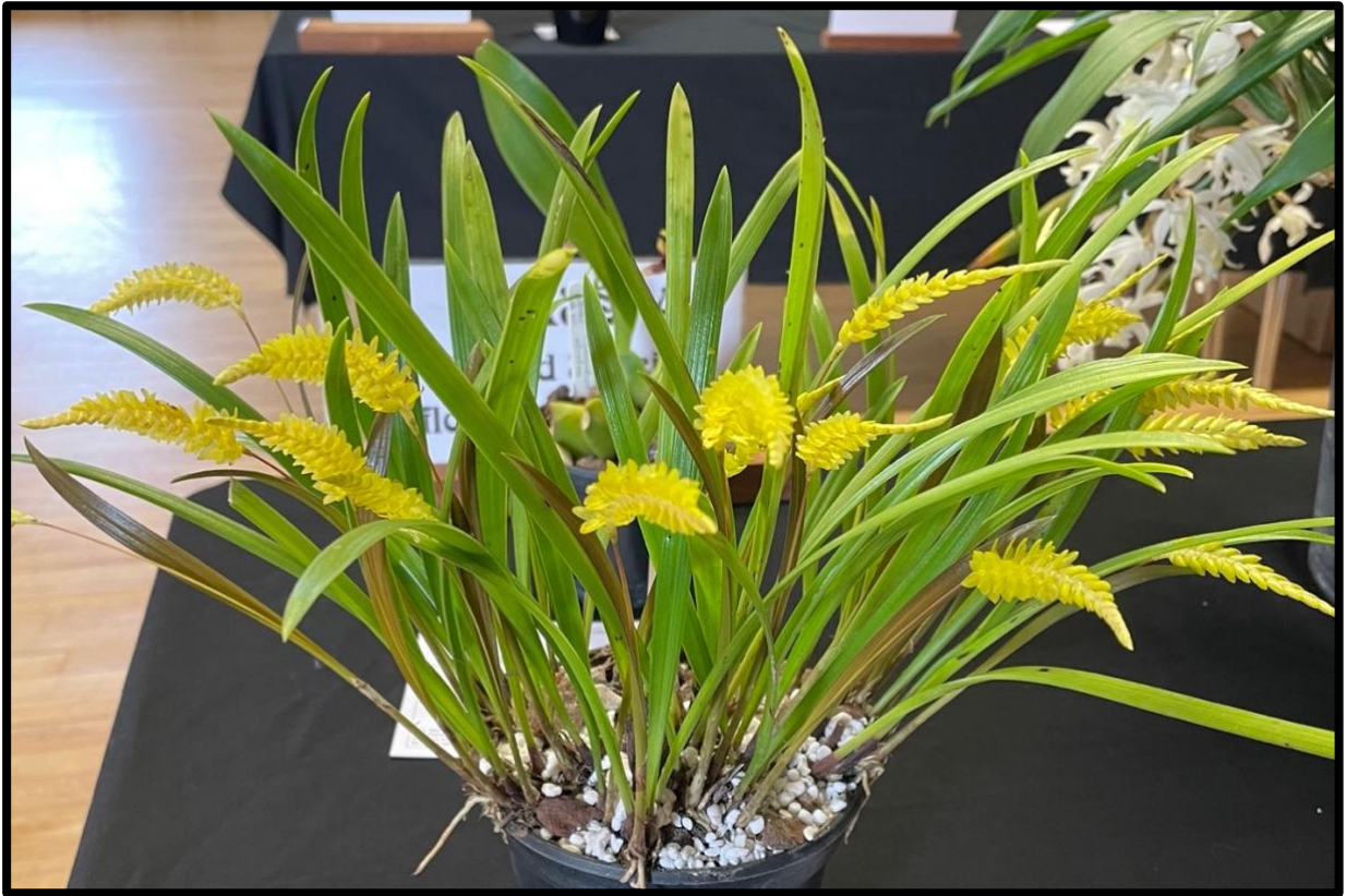
Class 4. Dendrochilum javierense