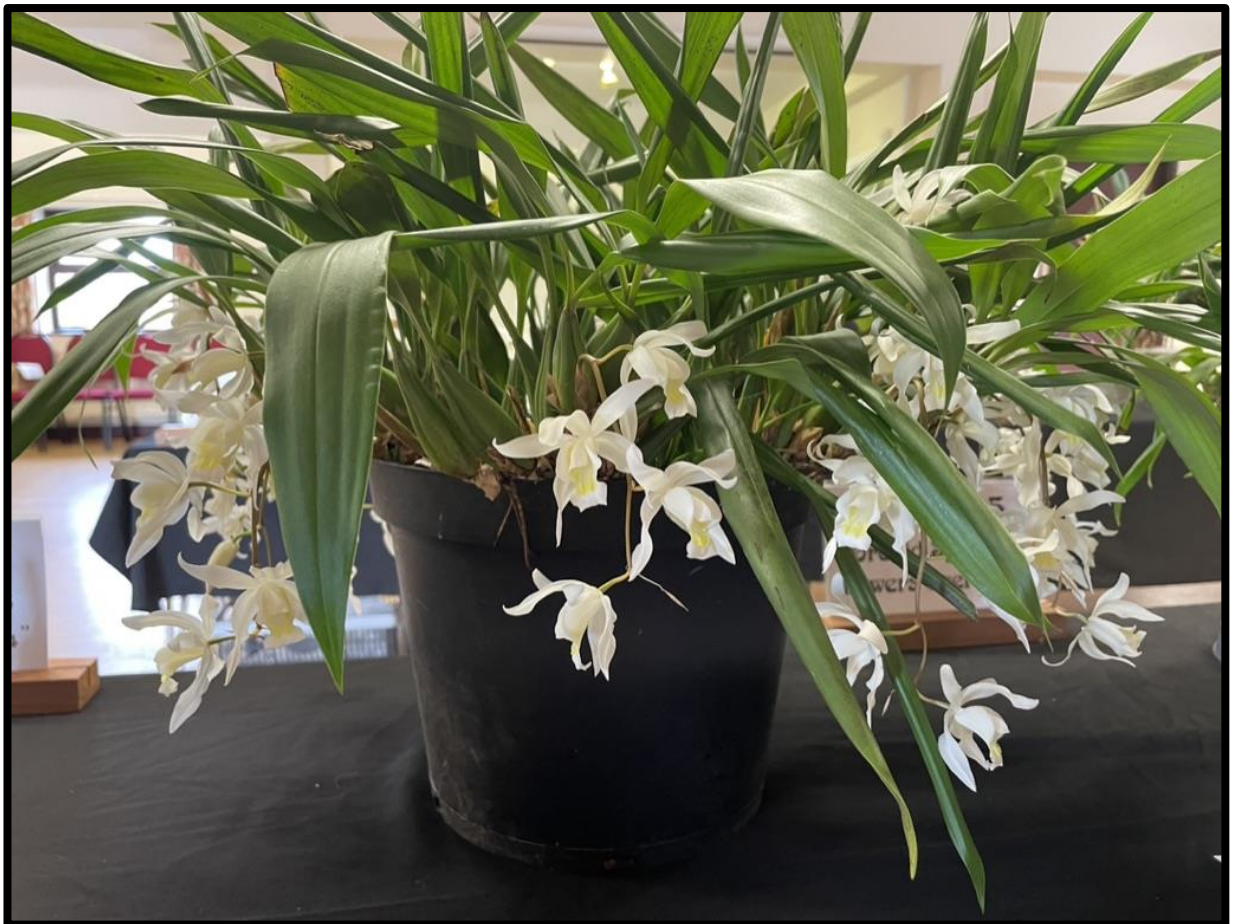
Class 5. Coelogyne glandulosa