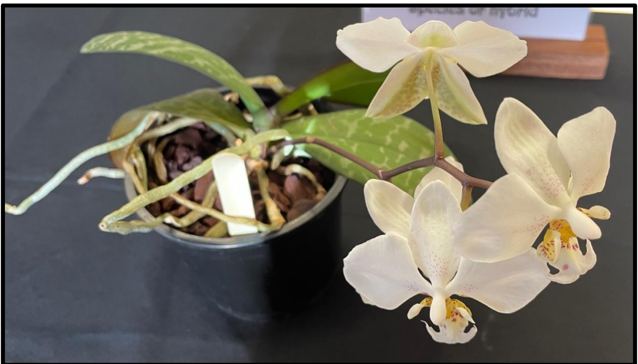
Class 13. Phalaenopsis stuartiana