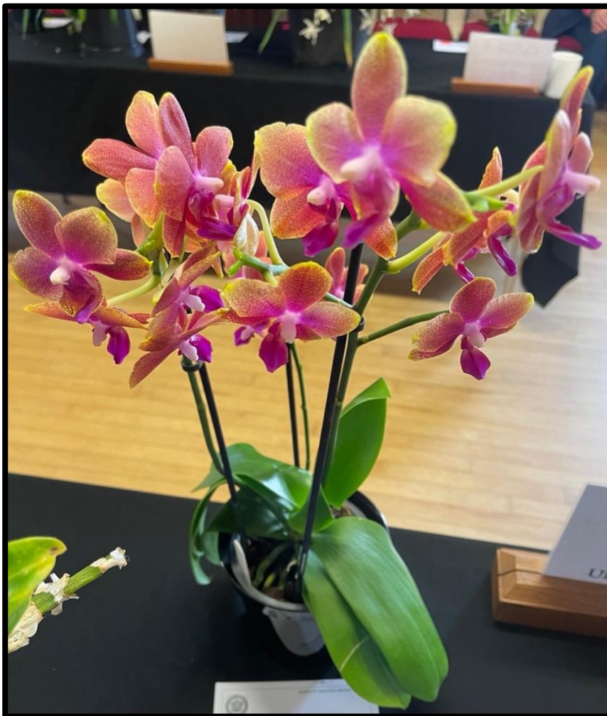
Class 23. Phalaenopsis hybrid