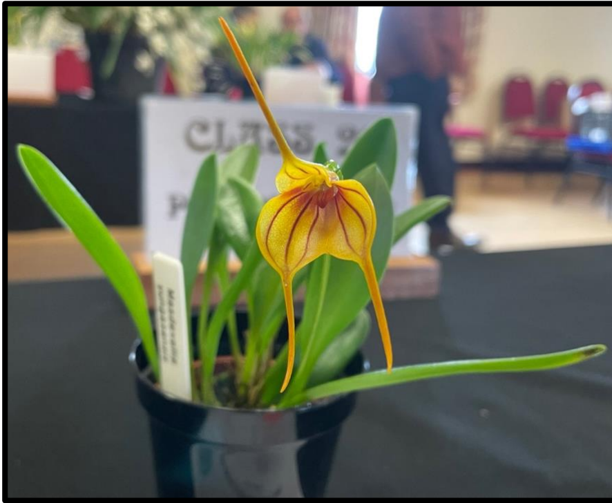
Class 22. Masdevallia yungasensis