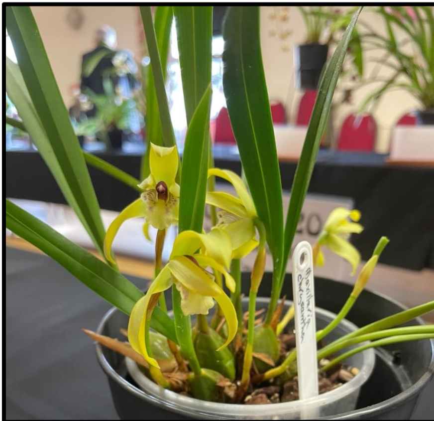
Class 20. Maxillaria chrysantha