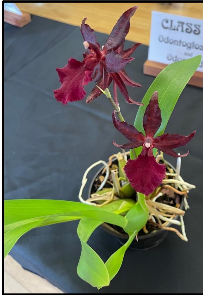
Class 12. Colmanara Wildcat