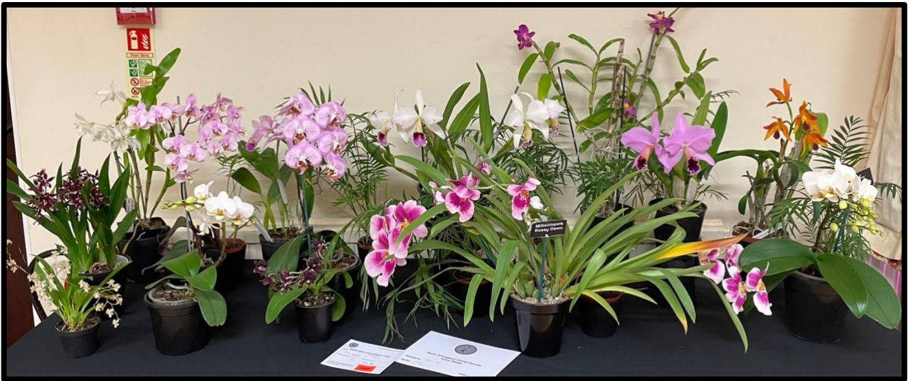
Class 2. Small group