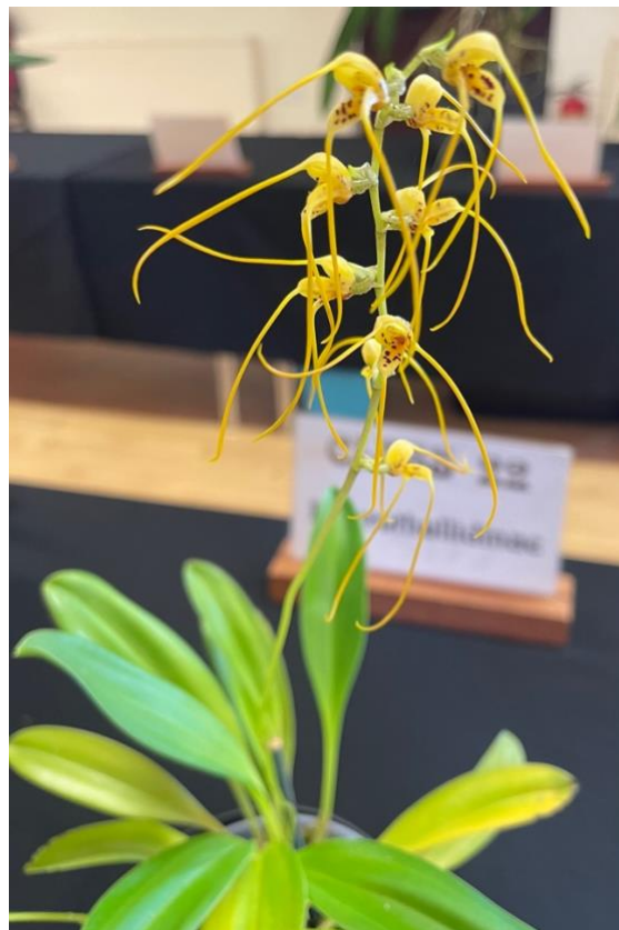
Class 22. Masdevallia lehmanii