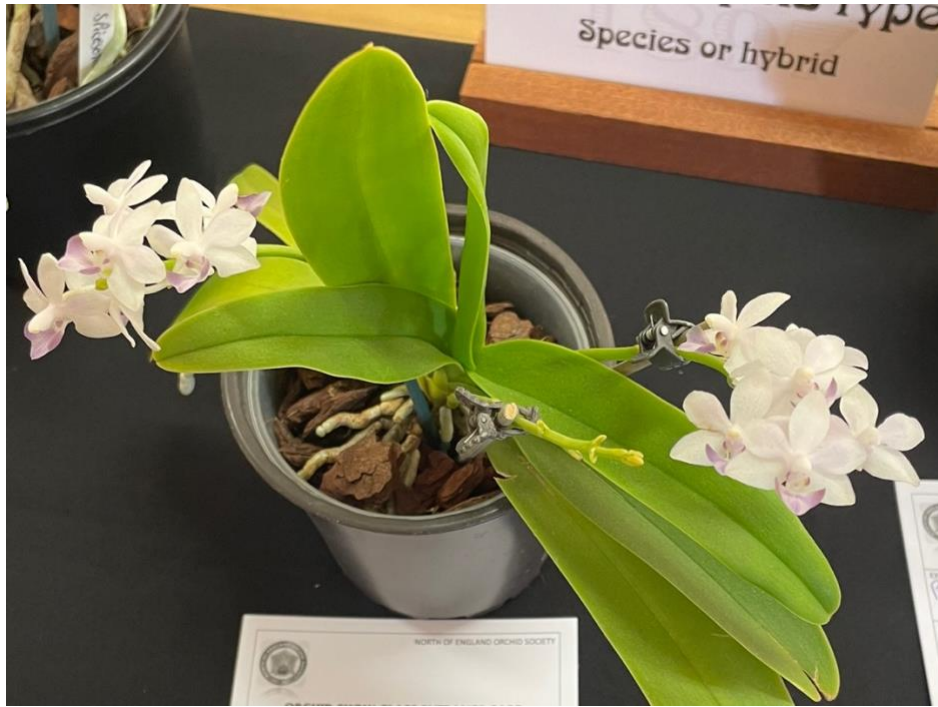
Class 13. Phalaenopsis Tzu Chiang Sapphire