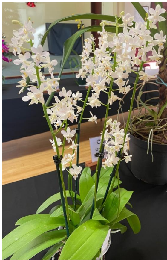
Class 4. Doritis pulcerrima album