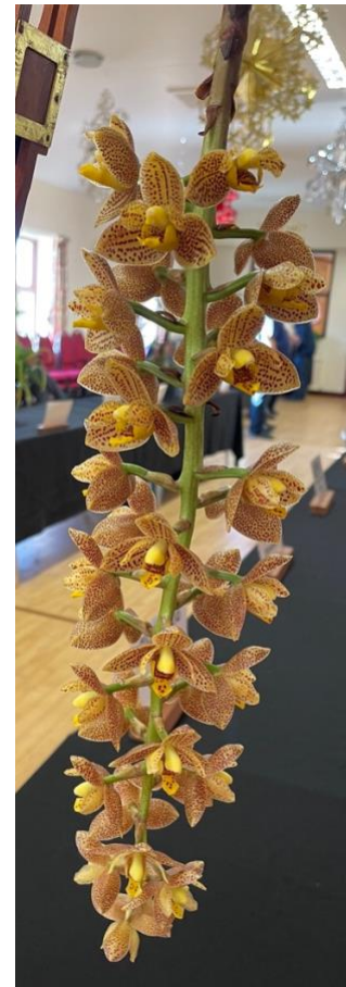
Class 15. Suspended beneath a splendid tripod, Lueddemannia striata x Acineta superba