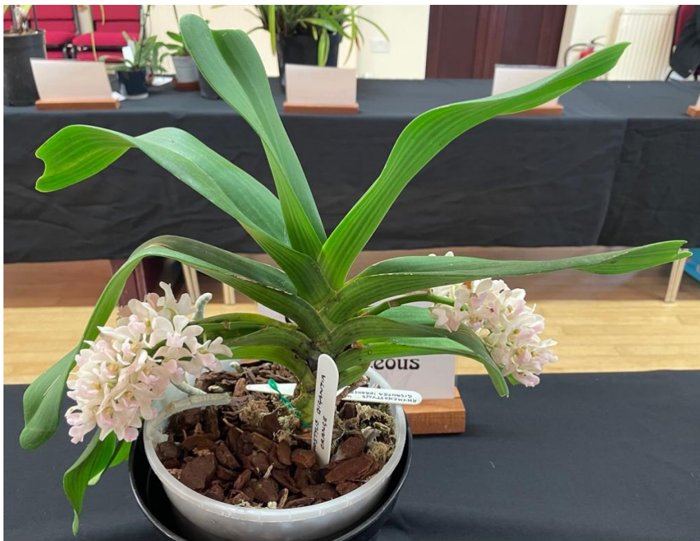
Class 19. Rhynchostylis gigantea Orange