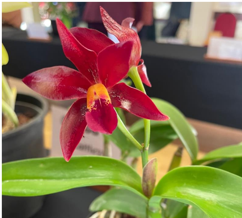
Ian Eastwood's Class 10 Cattleya Chocolate Drop