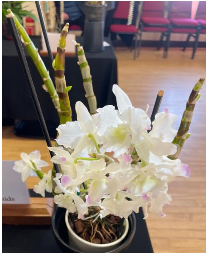
Class 23. Dendrobium hybrid White