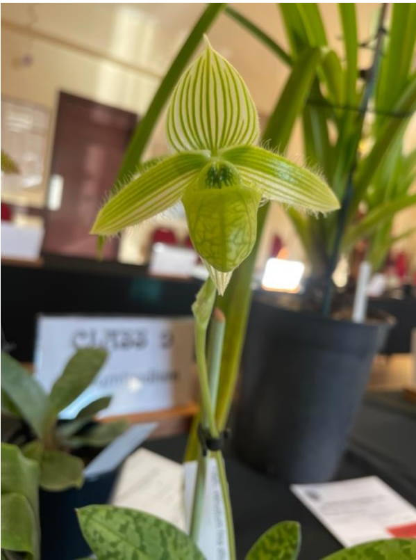
Paph venustum fma. album