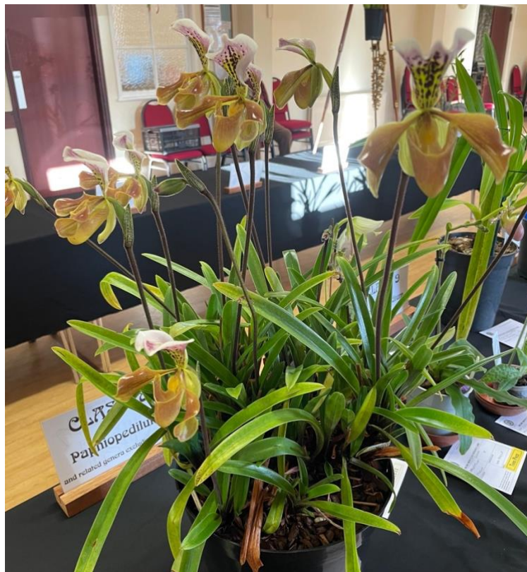
Class 8. Paphiopedilum gratrixianum