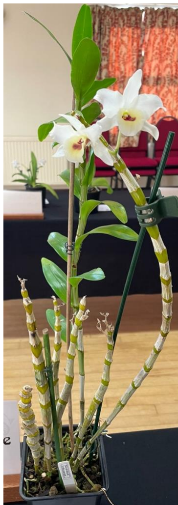
Class 14. Dendrobium findlayanum