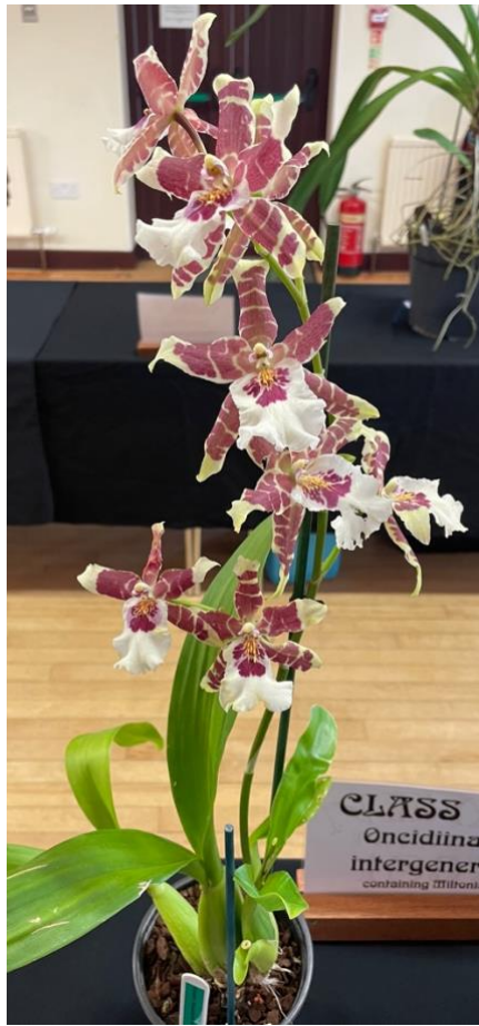
Class 21. Aliceara Renaissance White