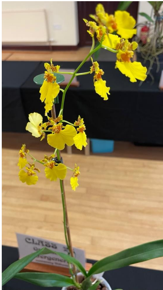
Allan Brown's Class 21 Oncidium varicosum