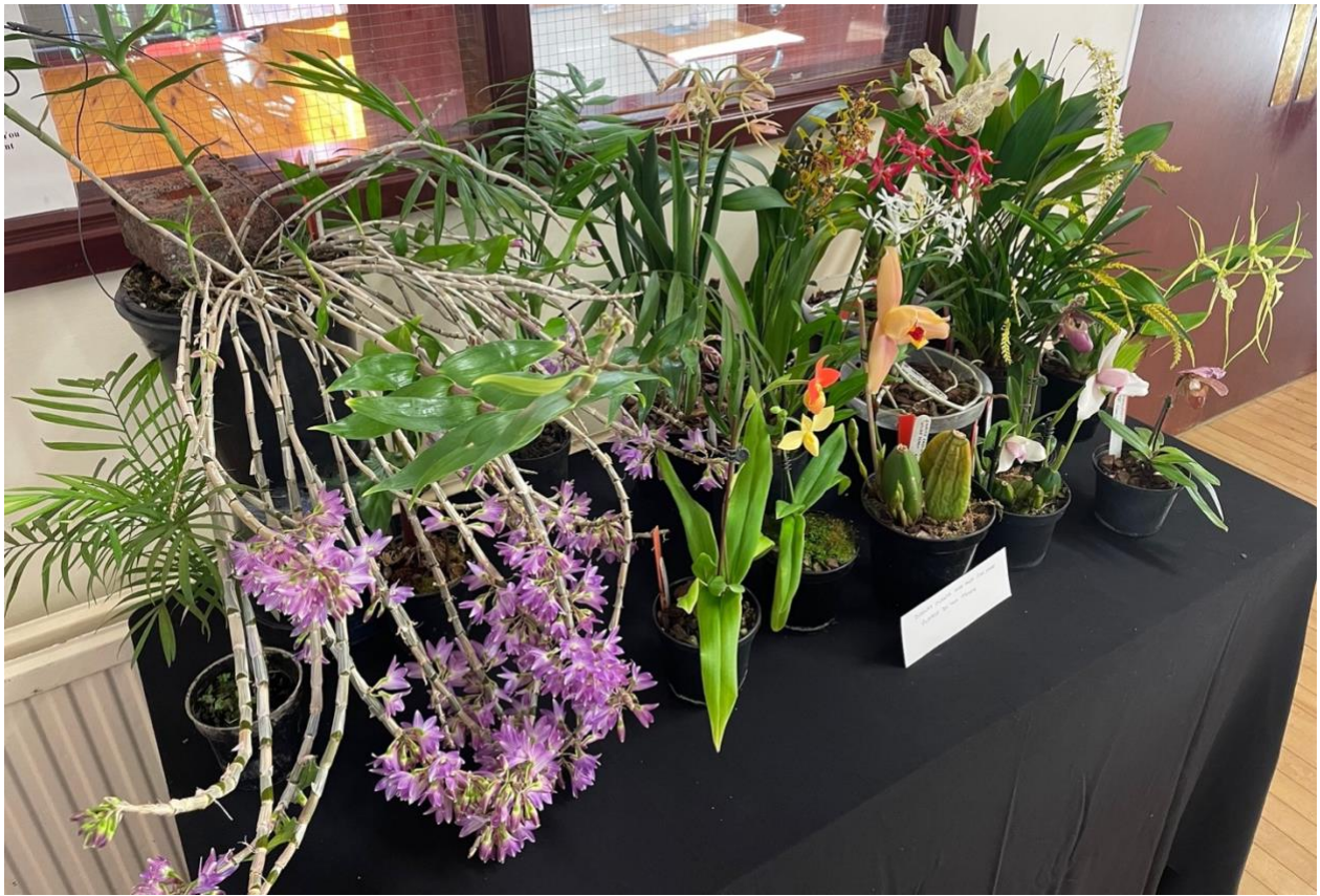
The Phoenix Orchids display.