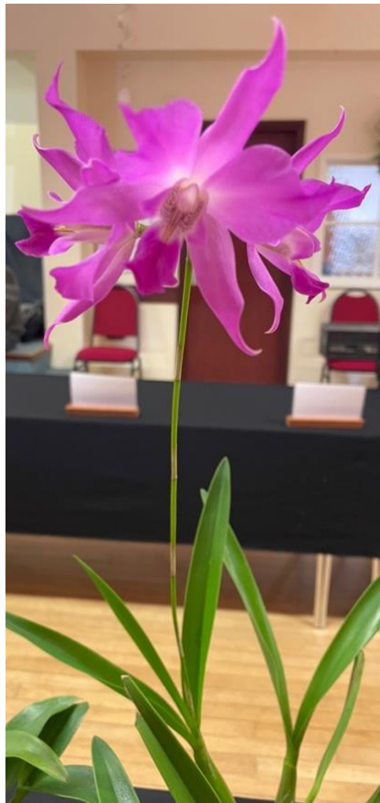
Class 10. Laelia gouldiana