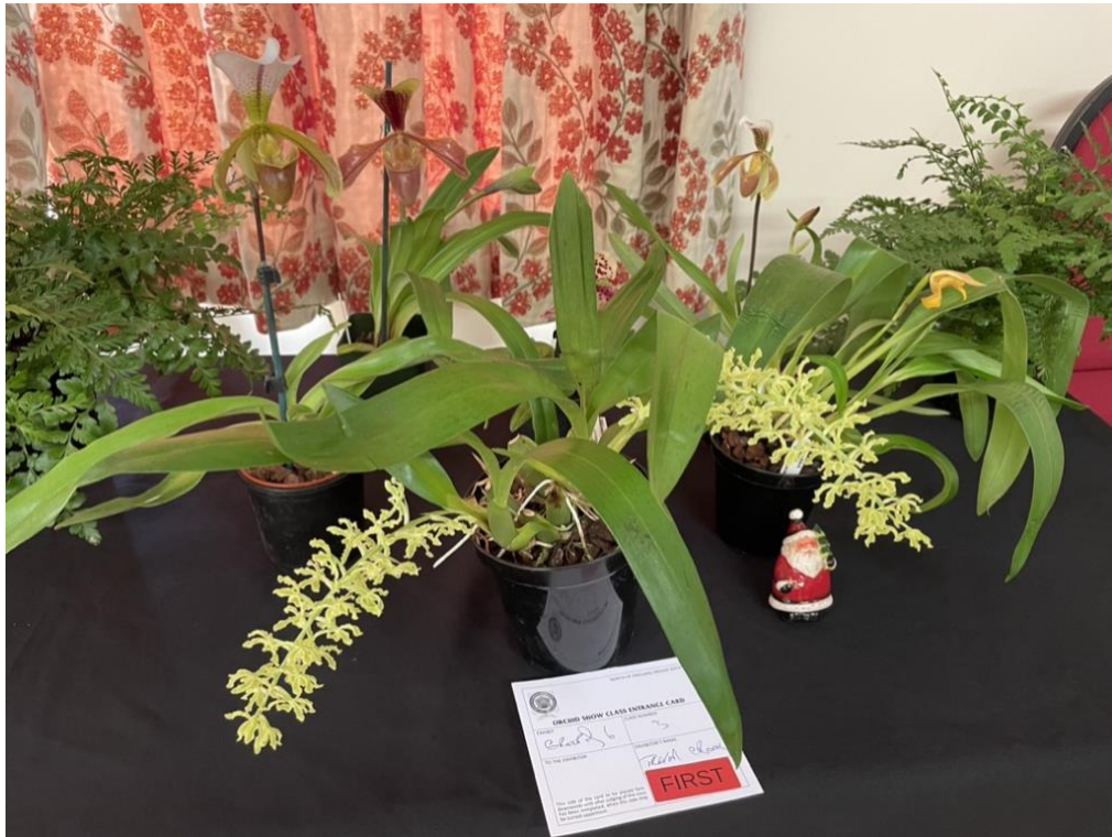
Class 3. Group of six orchids