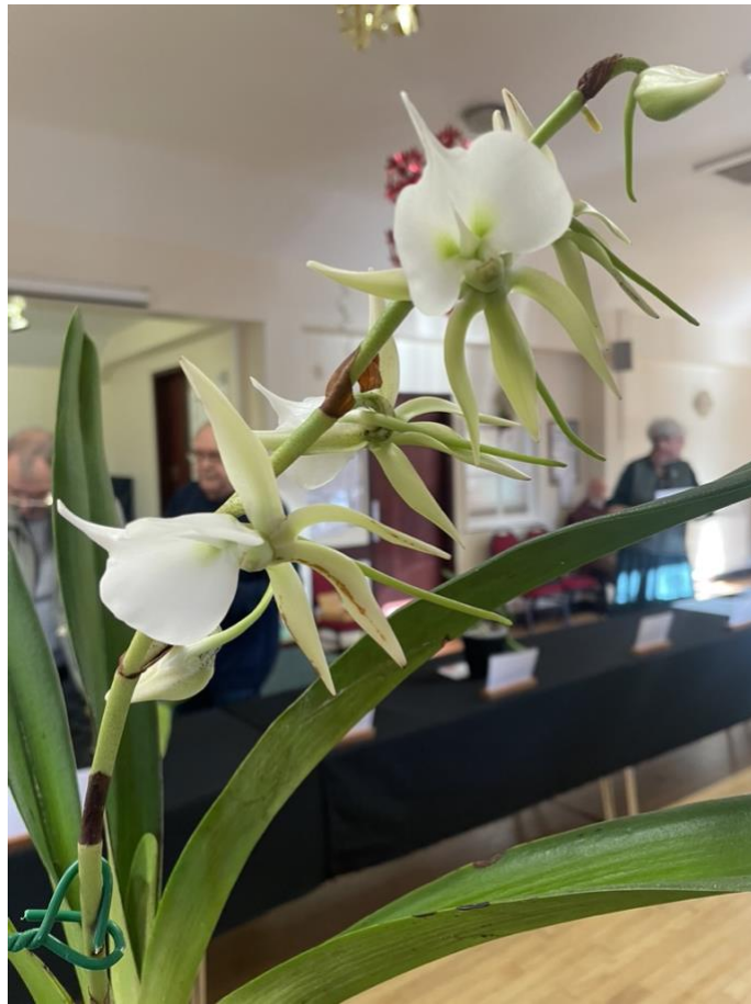
Class 5. Angraecum eburneum